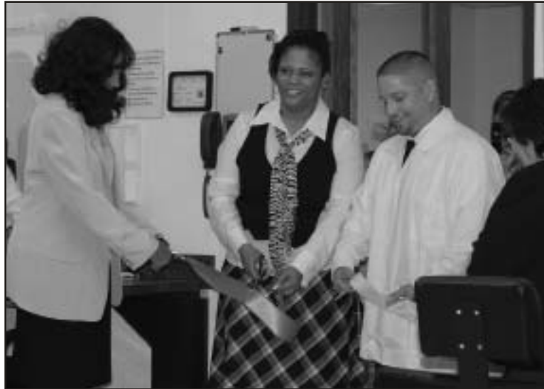
TDLR welcomes new Barber School at Houston Community College.