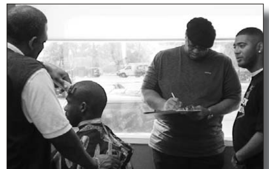
Barber Shops continue to play a role in the community. Members of African-American Alpha Phi Alpha fraternity sign up mentors for Big Brothers in Austin at local shops.

Perhaps one day, someone, will look at the photos taken on a Saturday in Austin, Texas, and think to himself, "way back in the old days barber shops were a vital part of the community, just like today." Change can be a good thing in some instances, but the friendships and bonding found in the neighborhood barber shop is one thing that will stay the same.